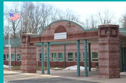
Middle School of Plainville 150 Northwest Drive