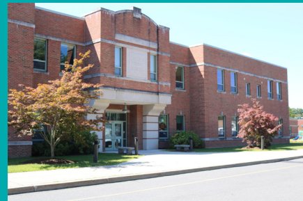
Linden Street School 69 Linden Street

Medicaid, Medicare, and commercial health insurance welcome. A sliding fee scale is available based on family size and income. No patient will be denied health care services due to an individual's inability to pay for services.