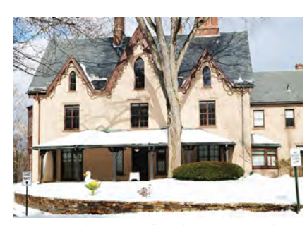
Exterior of 49 Woodland Street, Hartford.

In January 2018, Wheeler opened the Hartford Family Health & Wellness Center (FHWC) campus at 43–49 Woodland Street, providing primary care, pediatric care, behavioral health, dental