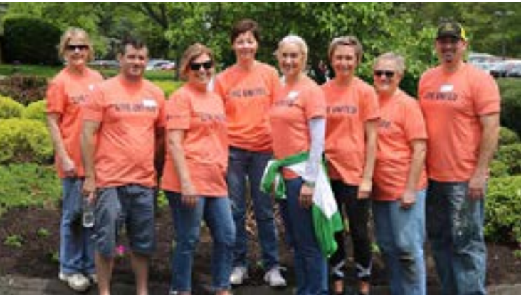
Thanks to the volunteer employees from Farmington Bank for beautifying our 91 Northwest Drive location on May 18 as part of the United Way of West Central Connecticut's 27th Annual Day of Caring.