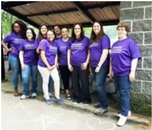
Wheeler's Foster Care team hosted an event at Norton Park, Plainville to celebrate and thank our foster families.