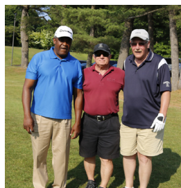
▲ Yarde Metals

In 2015, Wheeler hosted its 30th Annual Wheeler Golf Classic at The Country Club of Farmington to benefit individuals and families served by the organization and celebrate the enduring commitment of tournament founders and supporters. Since the mid-1980s, the event has raised nearly $997,000.