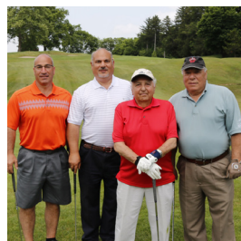
▲ Production Fasteners