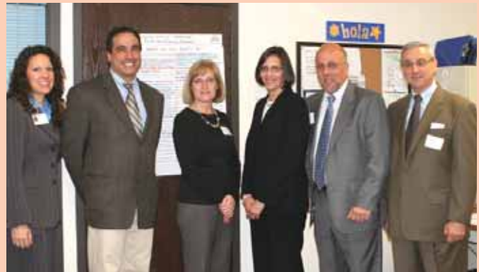
Wheeler Clinic staff and funders celebrate the opening of the clinic's new Alternative in the Community program in Meriden. The program is funded by the Connecticut Judicial Branch, Court Support Services Division (CSSD).