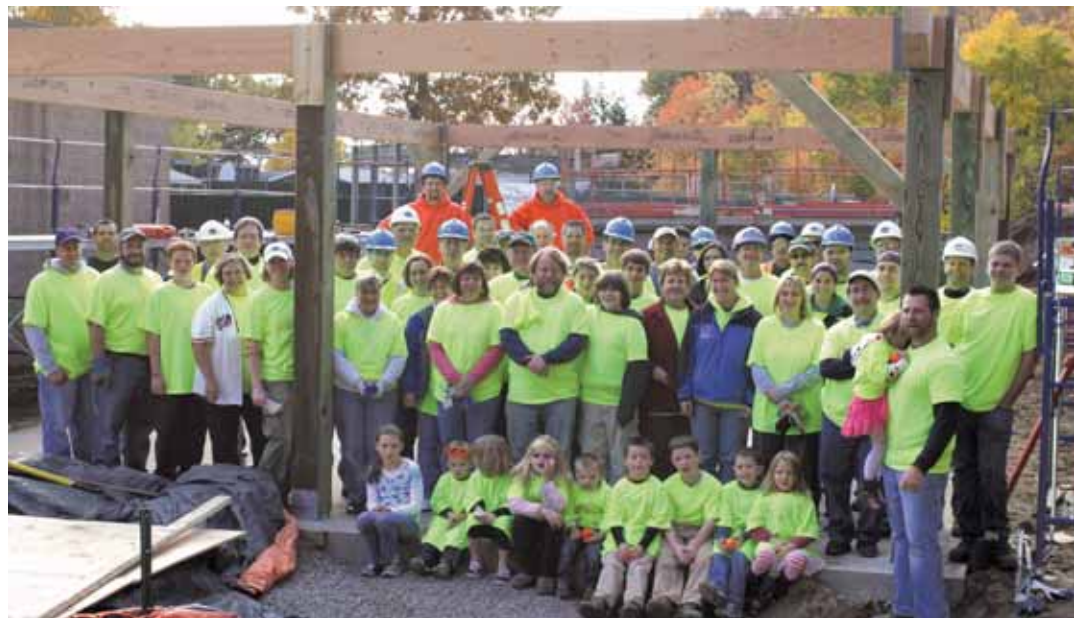
More than 60 volunteers, employees of Loureiro Engineering Associates, Inc. and their families, transformed parts of the recreation area at Wheeler Clinic's Northwest Village School last fall to create outdoor classroom space at the 91 Northwest Drive property. The project, a generous donation from the employee-owned environmental engineering firm, created enhanced settings for learning, including a large wooden pavillion, new greenhouse base and additional planting beds.

United Way of West Central Connecticut for support of Children's Outpatient Services, the Senior Emotional Health Outreach Program and Parent Connections for Early Childhood Development